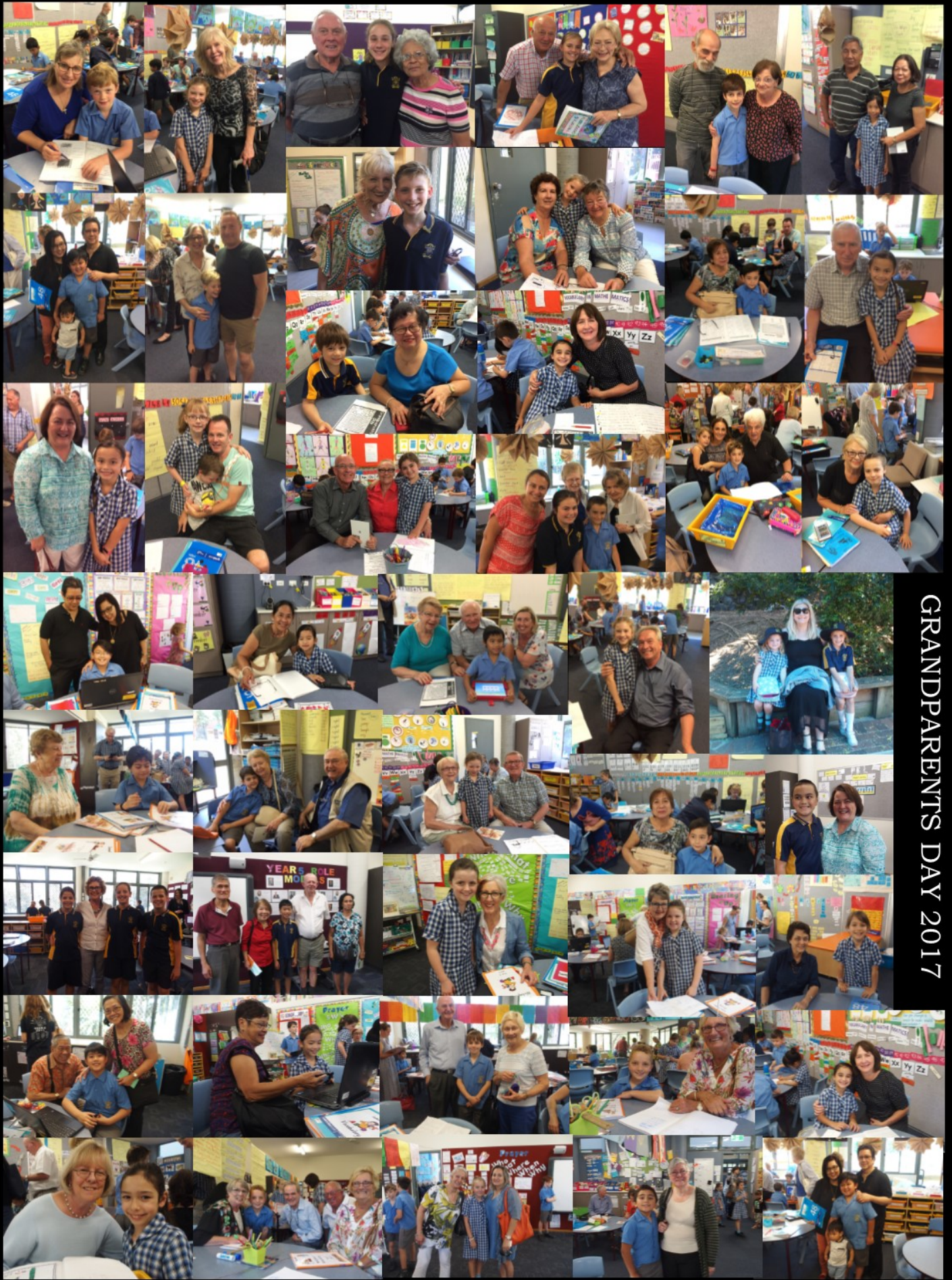
GRANDPARENTS DAY 2017