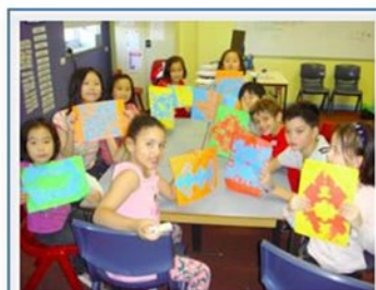
Arts and crafts